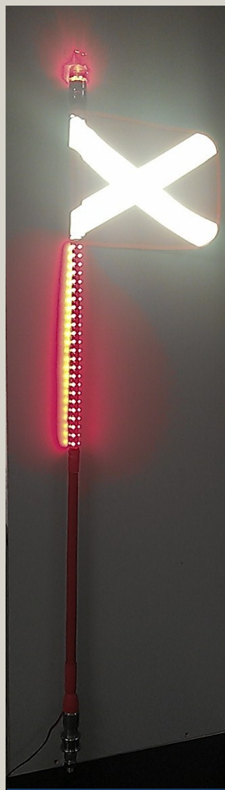
Turned on, with bright light directed at whip.