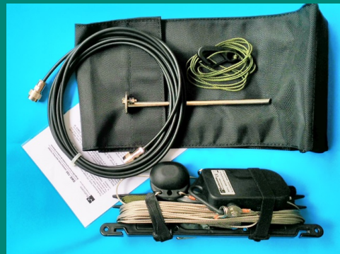
SWE-100P 24 metre single wire end fed HF broadband antenna with quick deployment accessories.