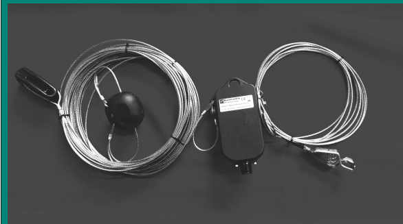
SWE-100K 24 metre single wire end fed HF broadband antenna with optional quick deployment accessories.